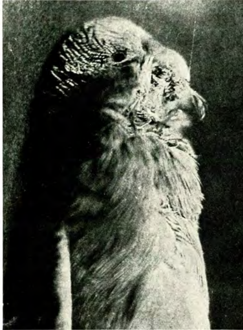
Fig. 2: Scaly, crusted mycotic lesions on the parrot

It was a nice, multicoloured (green, red and blue) male parrot ( Melopsittacus undulatus ) having (on the neck, head and chest) a few scaling crusted lesions, mainly in the area around the beak, near the eyes and involving also some feathers (fig. 2). Small