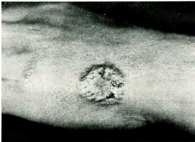
Fig. 1: Inflammatory lesion on the woman's hand

B. V., woman, 52 years of age, with an erythematous-vesiculous round plaque, on her left hand, 2 cm. diam., with slightly inflammatory raised borders. A smaller, but similar lesion, could be observed near the little finger of the same hand (fig. 1). The first signs